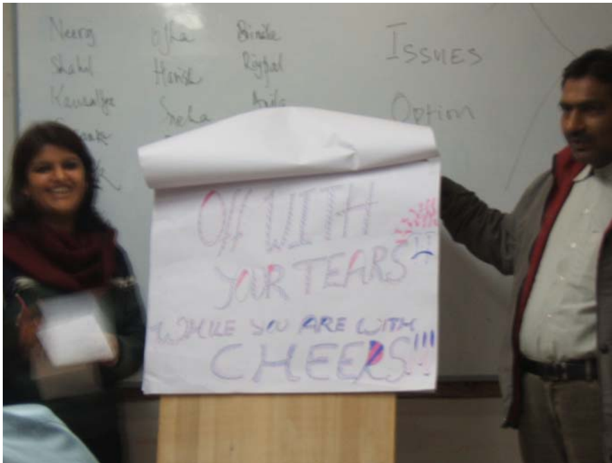
Slogan Presentation by Group 1