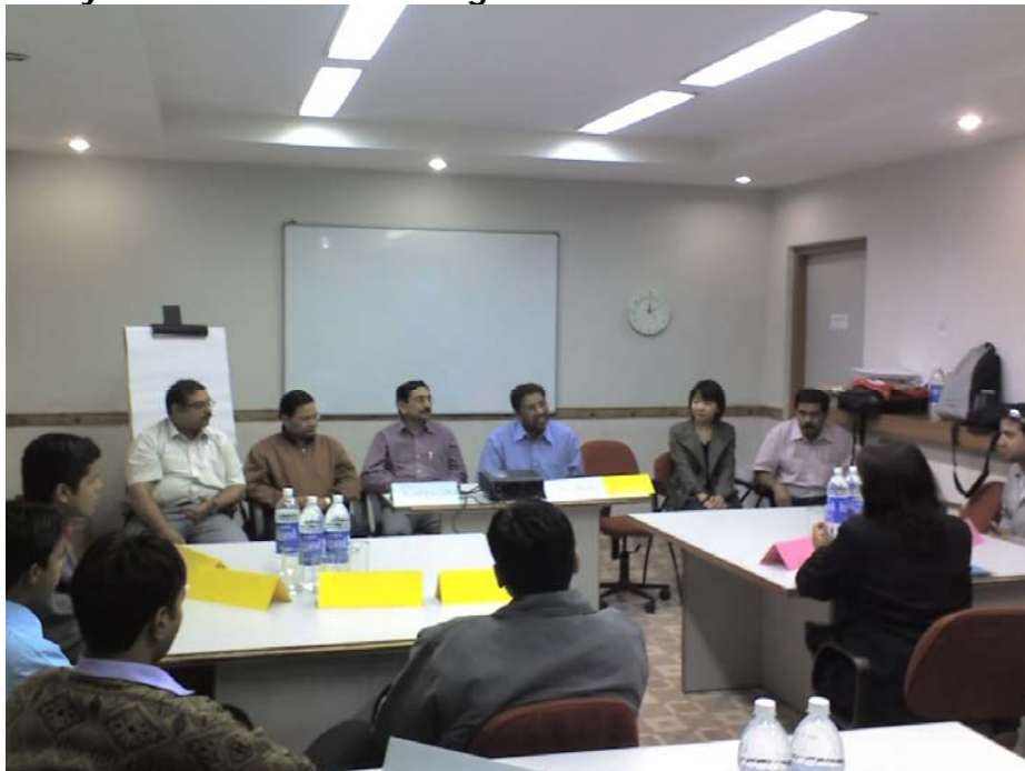
Workshop Inauguration by UNIDOC directors