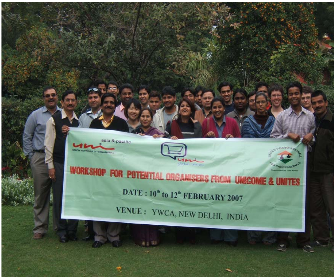
Group Photo on the lawns of YWCA

All these thirty-five activists had achieved a sense of oneness, understood their rights at their respective work places and pledged to work with UNICOME & UNITES.